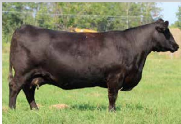
U2 Rosebud IF - Dam