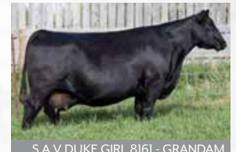
S A V DUKE GIRL 8161 - GRANDAM

BROOKING BANK NOTE 4040 BROOKING ANNIE K 390 S A V NET WORTH 4200 A C DUKE GIRL 57