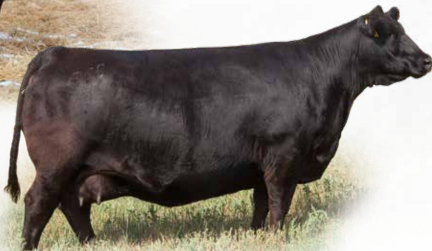
Brooking Beauty 333 - Granddam