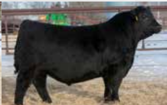
SPRUCE VIEW ANGUS