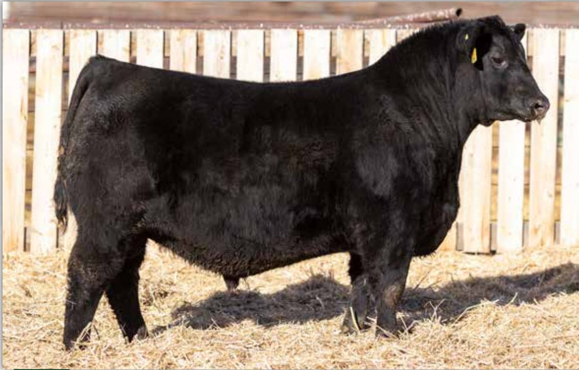
20 BROOKING Emerald 3133 2312216 - JSTN 133L - January 25 2023