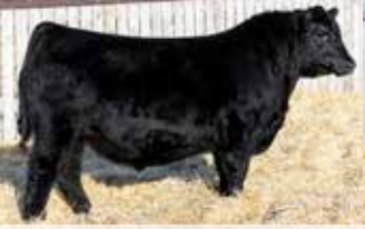
SCHWAN AND GEHL