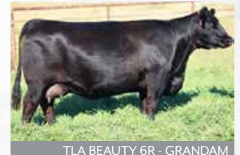
TLA BEAUTY 6R - GRANDAM

Another good looking son of Brooking Emerald 9179. This herd sire candidate is straight topped, long from end-to-end, has extra substance of bone and is heavy haired. He had the second heaviest gain on test from weaning to yearling boasting over a 1400lb yearling weight. His powerful dam is a stout featured and long made daughter of SAV Cutting Edge. The grandam is the iconic TLA Beauty 6R. Who is widely responsible for the success of our operation.