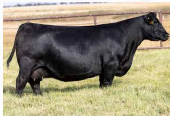
Brooking Beauty 7051 - Dam

Allow me to introduce Lot 1, Brooking Next Generation 3013. This bull has been an early favorite. He possesses an impressive amount of hip, shape, volume, mass, power, and showcases the ideal Angus head. From the moment he was born, he has stood out as an exceptional individual. Brooking Next Generation 3013 closely resembles his sire, the renowned Brooking Next Generation 1038, who was sold for an impressive $85,000 to Voss Angus in Iowa. In addition to his sire's influence, his dam, Brooking Beauty 7051, is what we consider the ideal Angus cow. She is big-bodied, has an awesome udder, excellent feet, a beautiful Angus head, and is highly productive. She holds elite status within the Canadian Angus Association, boasting a weaning ratio of 106 on 5 calves. We are using a maternal brother, Brooking Frontline 2002, who was a top seller last year, that has some ultra exciting calves on the ground. Furthermore, the grandam of Lot 1 is the iconic TLA Beauty 6R, the matriarch of the esteemed Beauty cow family. With such a strong pedigree and outstanding physical traits, Brooking Next Generation 3013 has a bright future ahead. He embodies the potential for genetic advancement and is sure to make a significant impact.