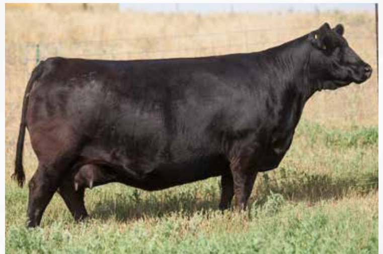
Brooking Beauty 333 - Granddam

These high quality Brooking Emerald 9179 sons are all peas in a pod. If you see one you can immediately tell they are an Emerald. They are all perfect in their structure, hold their head high, have great feet, soft hair, square hipped and have massive dimension. Again, Brooking Emerald 3108 is exactly that. The dam is a low birth weight daughter of the pathfinder sire LD Capitalist 316. Brooking Beauty 0086 has a very nice udder, is deep bodied and quiet natured with an angular front-end. The granddam is the obvious cornerstone of our operation and is one of the breeds great cows.