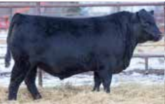
LABATTE / LAZY Y