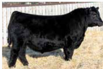
Brooking Frontline 2002 Maternal Brother

Allow me to introduce Lot 1, Brooking Next Generation 3013. This bull has been an early favorite. He possesses an impressive amount of hip, shape, volume, mass, power, and showcases the ideal Angus head. From the moment he was born, he has stood out as an exceptional individual. Brooking Next Generation 3013 closely resembles his sire, the renowned Brooking Next Generation 1038, who was sold for an impressive $85,000 to Voss Angus in Iowa. In addition to his sire's influence, his dam, Brooking Beauty 7051, is what we consider the ideal Angus cow. She is big-bodied, has an awesome udder, excellent feet, a beautiful Angus head, and is highly productive. She holds elite status within the Canadian Angus Association, boasting a weaning ratio of 106 on 5 calves. We are using a maternal brother, Brooking Frontline 2002, who was a top seller last year, that has some ultra exciting calves on the ground. Furthermore, the grandam of Lot 1 is the iconic TLA Beauty 6R, the matriarch of the esteemed Beauty cow family. With such a strong pedigree and outstanding physical traits, Brooking Next Generation 3013 has a bright future ahead. He embodies the potential for genetic advancement and is sure to make a significant impact.