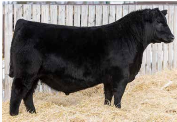
Brooking Radville 2208 - Maternal Brother