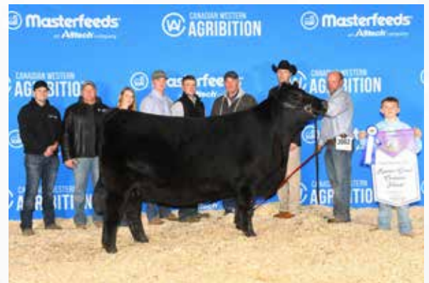
Dusty's Countess 22H - Dam

Here we go folks! One of the most attractively designed bulls we have ever sold. One thing you can expect at Brooking is when we have one that is attractive and clean fronted we expect them to have all of the goods. Brooking Emerald 3105 has massive rib shape, a big and wide hip, awesome feet and plenty of muscle and masculinity. His dam was Reserve Grand Champion at Agribition in 2021 and is owned with Greenwood Cattle and Ter-Ron Farms. The Grandam, Brooking Countess 7077 was Supreme Champion female at Farmfair and Agribition and was undefeated in division for three consecutive years. If you like winning banners and breeding great cattle at the same time you should consider owning this stud.