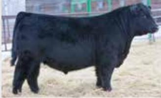
J SQUARE ANGUS