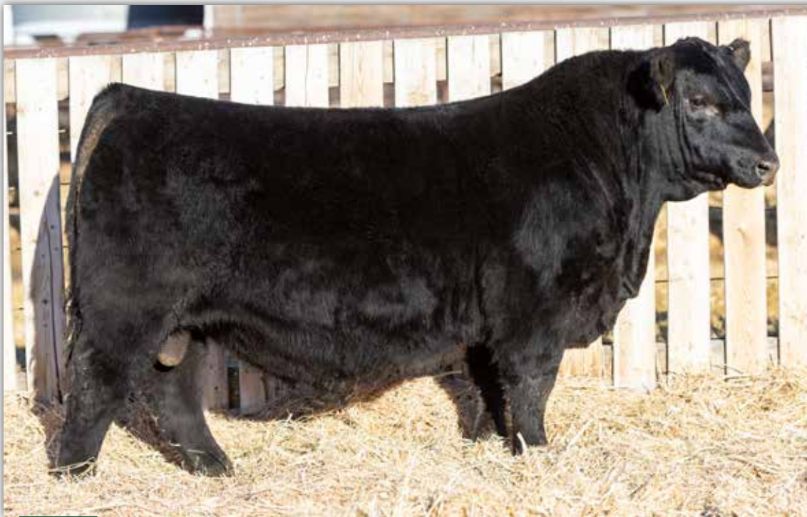
67 BROOKING America 3159 2322508 - JSTN 159L - February 01 2023

Recommended for heifers. A younger born ET bull raised without creep and in a really dry year. He is long bodied, long fronted with a smooth shoulder. His prolific dam is the number 1 income cow at Brooking and her genetic imprint on our operation is unmeasurable. The full sisters to Triumph are awesome females and coupled with Beauty 333 you should expect good things.