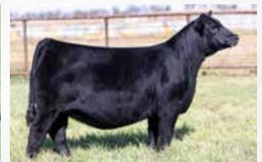
Brooking Rose 3011 Daughter