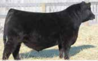
W SUNRISE ANGUS & CANADIAN SIRES