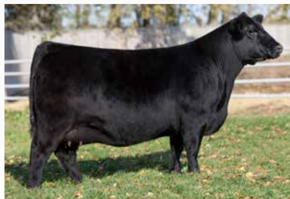
Brooking Countess 7077 - Granddam

Brooking Emerald 3188 is a good looking rascal. He has all the attractive looks and high quality structure courtesy of his sire and the added substance of bone, great hair, huge fluffy ears and big rib cage from his maternal line. His dam is a big bodied, easy fleshing female with good big feet and obvious production. The granddam is the famed Brooking Countess 7077 who originally sold to Dusty Rose and now resides at KT Ranches. Brooking Countess 7077 was a massive and structurally impressive female who achieved the supreme champion title at both Farmfair and Agribition, solidifying her reputation as an exceptional female.