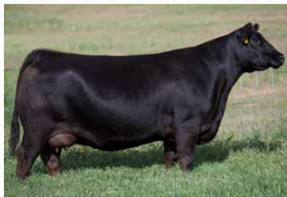
Brooking Rose 201 - Granddam