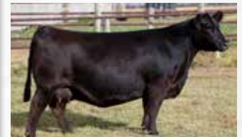
BROOKING BEAUTY 8062 - DAM

Introducing a remarkable cow power bull. The kind to sire market-topping steers and heifers for the replacement pen. This bull is a true embodiment of style, body, thick hair, and a big square hip. He is a natural calf out of the renowned donor, Brooking Beauty 8062, whose progeny have consistently excelled in various programs. In fact, her offspring were the high selling bulls in three different bull sales last year, solidifying her reputation as a top-notch producer. In our own program, we utilized a son of Brooking Beauty 8062 last year, and he surpassed all expectations by achieving the heaviest weaning weight in the history of Brooking. It is worth noting that Brooking Emerald 3183 not only comes from great cow families, but he also traces back to some exceptional cows multiple times, further enhancing his genetic potential.