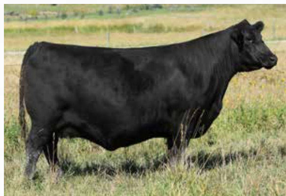
U2 Rosebud 157C - Granddam