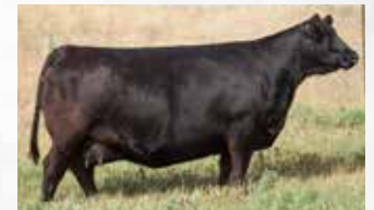
BROOKING BEAUTY 333 - DAM

S A V HERITAGE 6295 S A V EMBLYNETTE 7749 RR 7407 RAINMAKER 2154 TERRLENE BEAUTY 35F