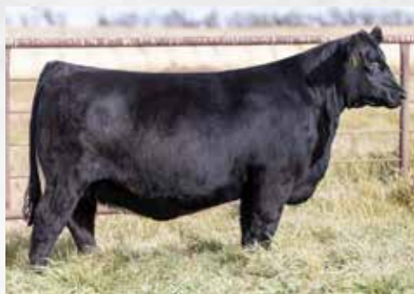
Brooking Beauty 1197

$100,000 ½ interest mat. sister sold to Steven Knutson and Rideau Angus