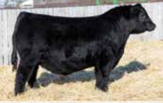
EMNDE LAND AND CATTLE