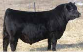
HAMCO CATTLE CO.