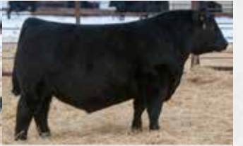
WIWA CREEK ANGUS