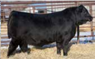
BONE CREEK ANGUS