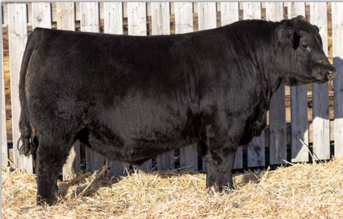
37 BROOKING Freedom 3049 2308313 - JSTN 49L - January 10 2023

Brooking Freedom 3029 is a cattlemen's deluxe herd bull. He has all the pounds and quality needed to get you the premiums. He has size, length and body dimension. His dam is one of the best looking Renovation daughters on the ranch. She is pretty fronted, awesome uddered, perfectly made, easy fleshing and docile natured. We owned the females for 4 generations and all were the same kind with outstanding udders.