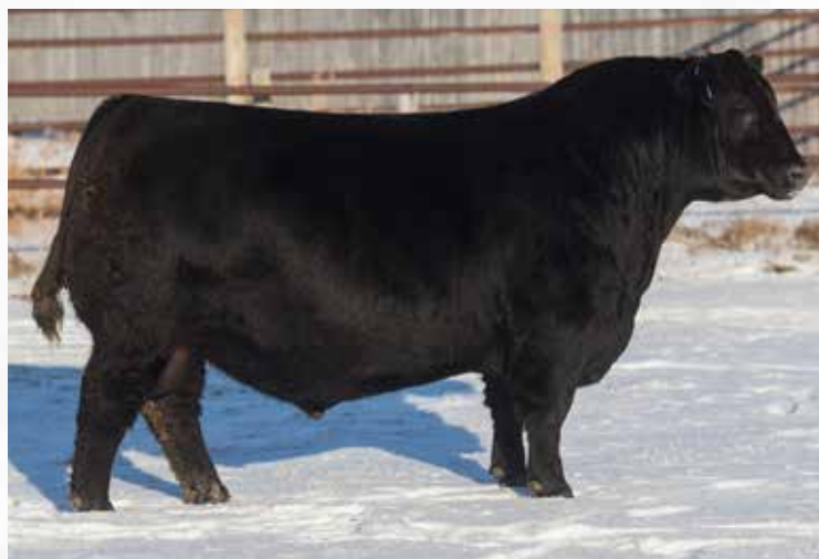
Brooking Firebrand 6068 - Maternal Grand sire

If you are like us and demand that your herd sire is a standout from an early age then make sure this bull resides in your pasture. He was the favourite prospect this summer by many including a group of Australians and other top cattleman. Early on Brooking Emerald 3039 looked like a herd bull with masculine characteristics, big rib shape, early scrotal development and a muscular hip and forearm. His moderate framed dam is easy fleshing, good uddered, good footed and productive dam. She has 107 weaning ratio on three progeny and has calved the same week four years in a row. The Clova Pride cow family has been a very fertile and consistent cow family for three generations at Brooking.