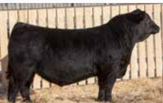
SCHICK / PACKETT