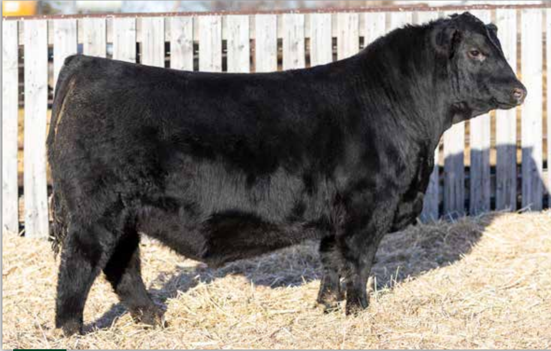
36 BROOKING Freedom 3029 2308298 - JSTN 29L - January 09 2023