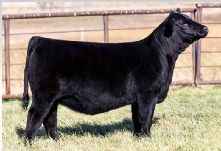
Brooking Blackcap 3125 - Daughter

In addition to his calving ease, Best Answer showcases a moderate frame, exceptional conformation, and an ability to easily maintain condition. These characteristics make him a highly desirable for your heifer pen, be sure to look to his sons, as they inherit the same qualities.