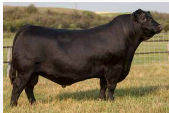
BROOKING EMERALD 9179 - Maternal Brother