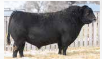
BROOKING RENOVATION 9327 - SIRE

Recommended for heifers. A negative birth weight bull that is the right type and kind with his balance and good structure. He is sired by Brooking Renovation 9327 who is a flushmate brother to Brooking National and Brooking Revival.