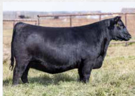
Brooking Beauty 1043

$40,000 full sister sold to Canadian Donors, Oberle Circle 7 and Grass Roots Ranch