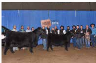
Brooking Countess 7077