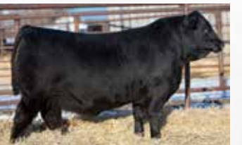
ANCHOR 1 ANGUS