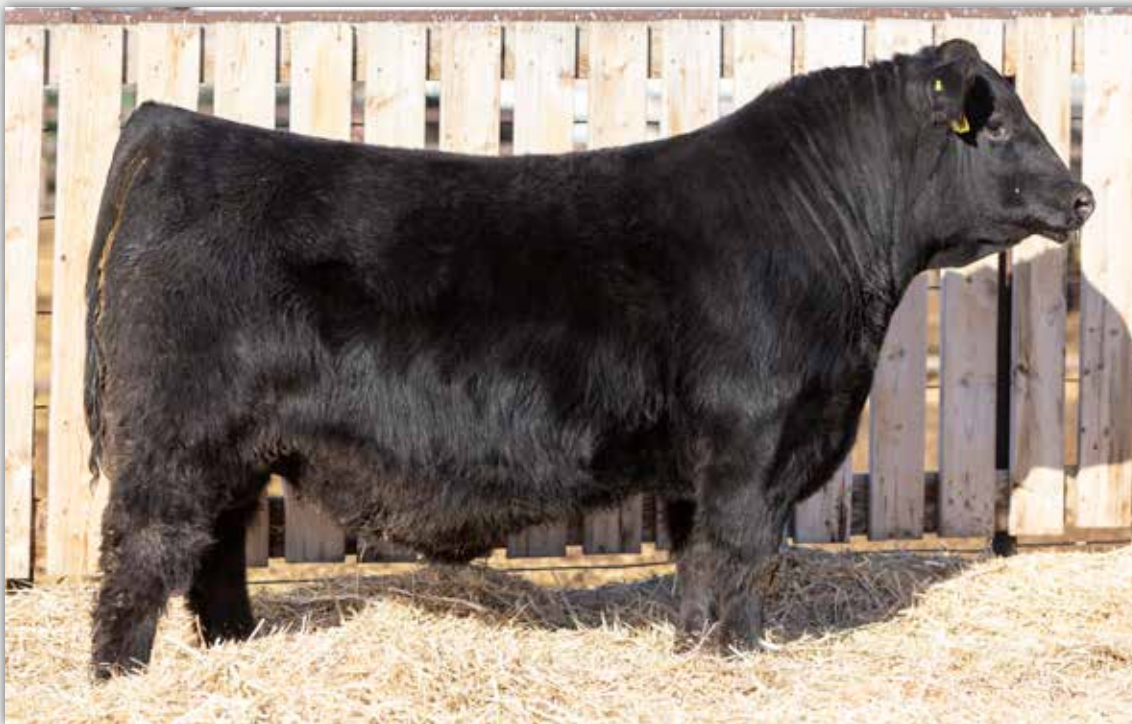
21 BROOKING Emerald 3168 Pending - JSTN 168L - Feb 4, 2023

Brooking Emerald 3133 has the credentials for the most disciplined program's demands. A low birth weight and high weaning weight combination. Matched with a high end phenotype and powerful design. These Emerald sons set a new standard for us. The young dam is a moderate framed daughter of the $95,000 Brooking Firebrand 6068. The grandam was in production at Brooking until she was 14 years of age. She had an incredible udder, extreme angularity and massively deep rib cage.