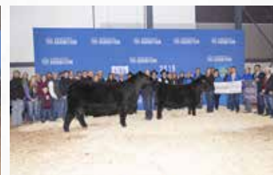
Brooking Countess 7077