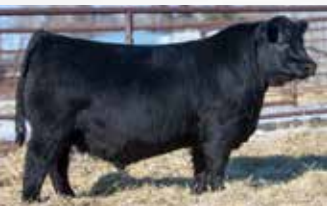
MR ANGUS RANCH