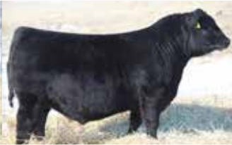
CARLSON ANGUS RANCH