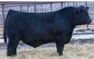
LOST RIVER COLONY