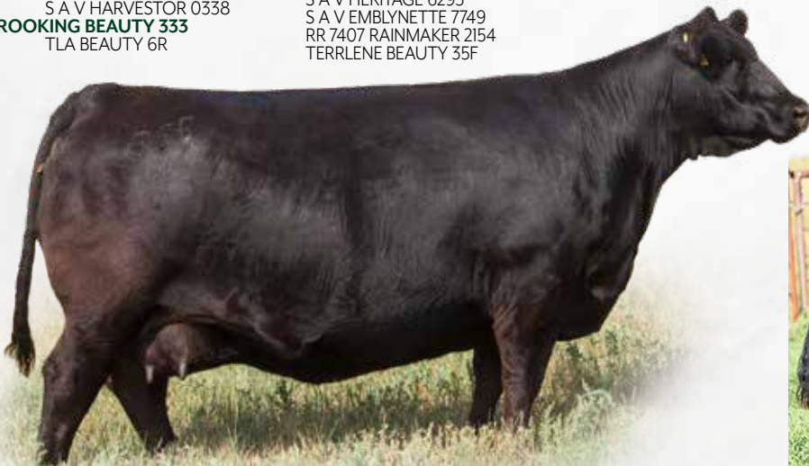
Brooking Beauty 333 - Dam

LOTS 9-10: These two flush mate brothers possess an impressive pedigree, boasting royal lineage. Their high-end quality structure is truly exceptional and leaves little room for criticism. They exhibit desirable traits such as length, cleanliness, and attractiveness in their front end, while also showcasing a long-bodied build and wide hip. Their athleticism on the move is remarkable, complemented by their excellent feet. Notably, one of their flush mate sisters created quite a buzz last fall, as she became one of the most talked about and adored angus heifer calves to show and sell in Canada across all breeds. She fetched an impressive price of $80,000 and was acquired by Duff Power Plus, OK and Lindskov's LT Ranch, SD. Additionally, she earned the prestigious title of Senior Heifer Calf Champion at Agribition. The dam, Brooking Beauty 333, holds the esteemed position of being our number one income cow and is an absolute powerhouse, having generated well over a million dollars. Her remarkable ability to consistently produce high-quality offspring further solidifies her reputation.