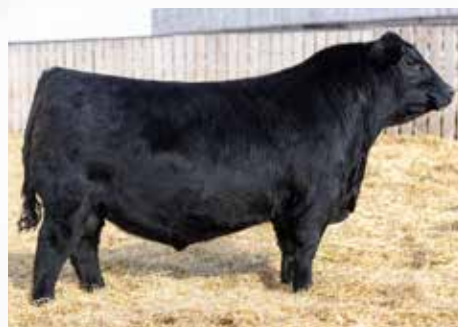
Brooking Freedom 1031