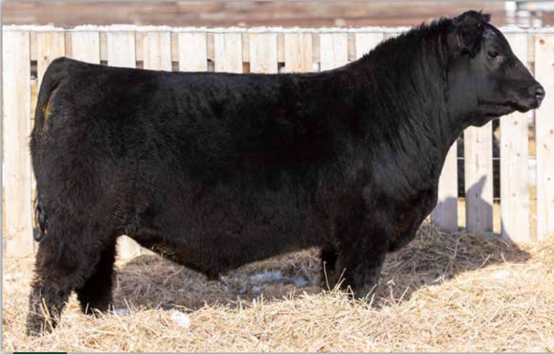
66 BROOKING Triumph 3212 2351281 - JSTN 212L - February 27 2023