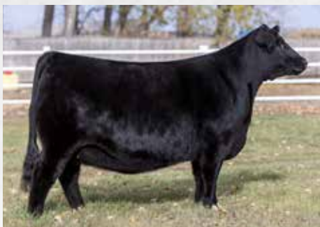
Brooking Beauty 1266

$100,000 ½ interest mat. sister sold to Steven Knutson and Rideau Angus