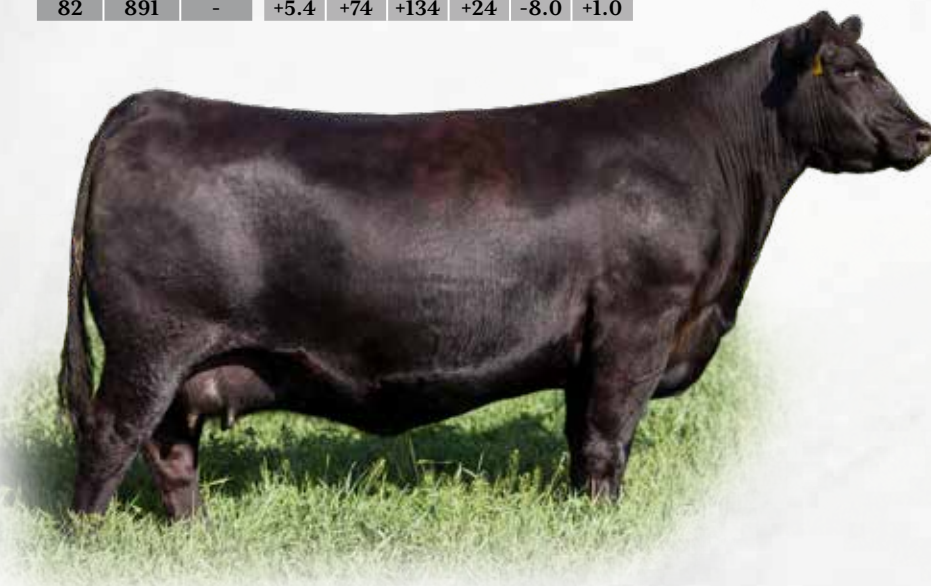
Brooking Beauty 6051 - Dam

His progeny's incredible quality is setting a new standard for type and kind. This is a testament to the enduring legacy that Emerald will leave in the pedigrees of great cattle for generations to come. His semen is not on the open market and one of the only ways to acquire his genetics is through direct progeny.