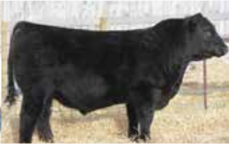
HOLLINGER & CSI