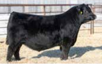
W SUNRISE AND Y COULEE