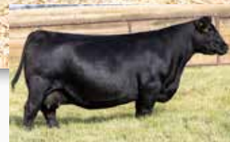
BROOKING BEAUTY 7051 - GRANDAM