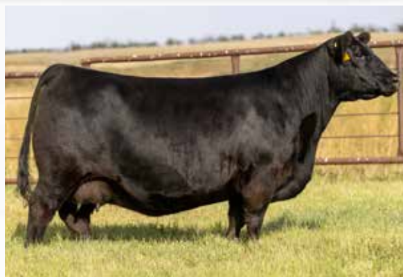
Brooking Rose 9076 - Dam

Brooking Bravo 3061 is a well-made balanced son of Coleman Bravo who is known as a sire of efficient and maternal progeny. Now add the incredible donor dam on the bottom side, Brooking Rose 9076 that has an extremely high quality phenotype, attractive look, nice udder and wide hip. The granddam is also an extremely well-made female that was ideal in her phenotype. The third dam is the iconic EA Rose 918 who is considered by many to be the ideal Angus cow. The daughters of this stud will be destined for the front pasture. Brooking Bravo 3061 was raised without creep and will be an impressive mature bull.