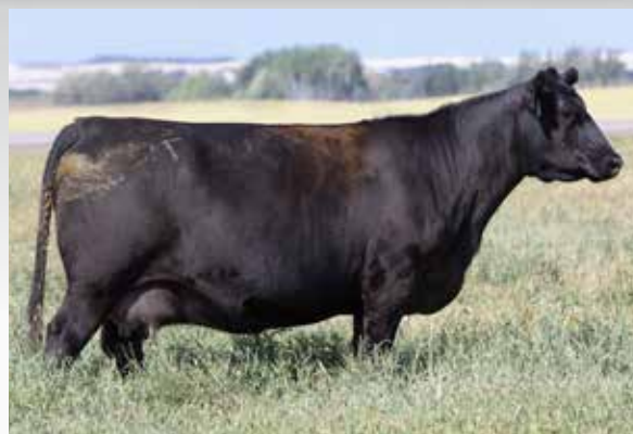
Belvin Georgina 121'17 - Dam

Belvin May City 0136 was the high seller at Belvin's 2021 female sale. He was a bull they had chosen to use in their own program showing their confidence in his breeding potential. May City is an outcross sire who has a combination of awesome muscle shape, a soft middle, great feet, big scrotal and a commanding presence with a docile nature. The best thing we admired about May City was his dam and the Georgina cow family supporting him. I do feel they are the best cows at Belvin. His dam Belvin Georgina 121'17 is deep ribbed, wedge shaped, great footed with an awesome udder. We have used May City successfully on our heifers. They are built right.