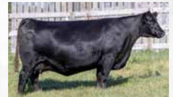
BROOKING ANNIE 8045 - DAM

S A V RENOWN 3439 S A V MADAME PRIDE 0151 SOO LINE MOTIVE 9016 BROOKING ANNIE 262