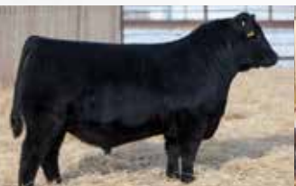
BOX ELDER FARMING