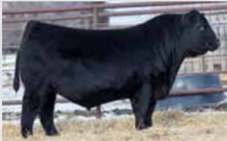
WIWA CREEK & CANADIAN SIRES