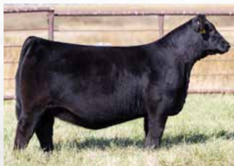
Brooking Beauty 3068 Flushmate to Lots 9 & 10