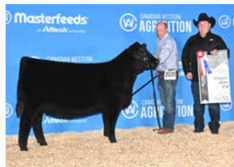
2023 Int Heifer Calf Champion