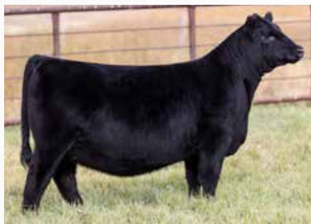
Grass Roots APH Beauty 335 Flushmate to Lots 9 & 10