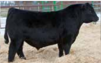
DUSTY ROSE AND ROCH SPRINGS