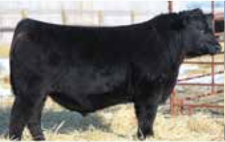
WILBAR CATTLE CO.