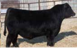
20/20 & CLINT CURRIE