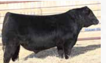
PERROT CATTLE CO.