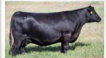
BROOKING MAUREEN EMILIE 350 - DAM

Recommended for heifers. If you prioritize the strength of cow families, we highly recommend considering this exceptional bull. His dam, Brooking Maureen Emilie 350, holds Elite status with the CAA and boasts an impressive track record. She has proven herself as the dam of esteemed bulls such as Brooking Rewind at Wilbar, Brooking Trendsetter at Wiwa Creek, and Brooking Firebrand at Diamond Seven. Notably, his dam, Brooking Maureen Emilie 350, displayed longevity by calving at the age of 11 and among the first few to calve. Additionally, the grandam also calved early this year at the age of 14, while the third dam produced offspring at Brooking until she reached the remarkable age of 16. The bloodline's longevity is truly remarkable and speaks volumes.