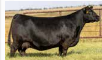
BROOKING ROSE 9076 - DAM

Brooking Renovation 3231 is one of the youngest bull in the entire sale offering and is an embryo calf out of one of our absolute best donors. Brooking Renovation 3231 is an attractive made, deep ribbed and good haired bull. His dam is an absolutely beautiful female with her extreme angularity, level hip, nice udder and high quality phenotype. She is extremely attractive in her design. A flush mate sister is among the best of the replacement pen. A maternal sister was a feature in our fall female sale and sold to Allen Bros, OR.