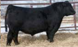
ROCKING HEART RANCH & LEWIS FARMS