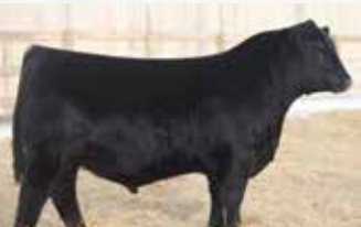
W SUNRISE ANGUS