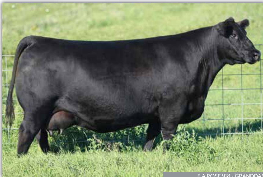
E A ROSE 918 - GRANDDAM

Recommended for heifers. A multi-generational calving ease bull. He is long bodied and smooth made. His dam is a flush mate sister to the $45,000 Brooking Rose 7021 and the granddam is the famed dam of Bank Note.