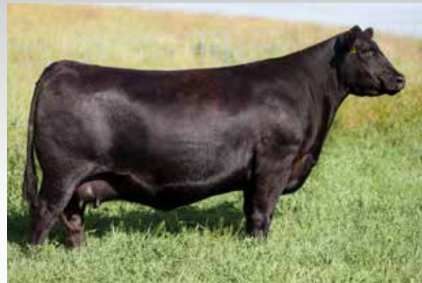
BROOKING BEAUTY 6051 - Dam

The sons of Freedom were our heaviest bulls at weaning. They are powerhouses, as they are easy fleshing, deep from end to end and stout made. We love the performance they have.