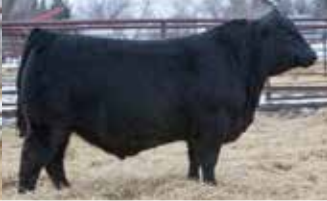
RIVERCREST ANGUS RANCH