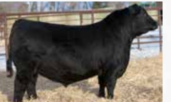
LOST RIVER FARMING