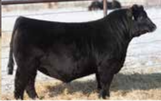
SCHWAN ANGUS RANCH