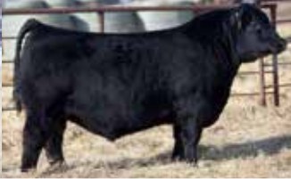
GRANUM FARMING CO