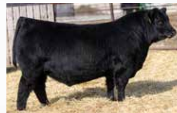
Brooking Dream Walker 1068 Maternal Brother