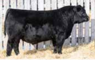
KATUS X7 RANCH