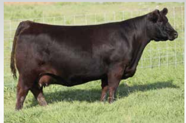
SOO Line Rose 1019 - Dam

Brooking Next Generation 1038 was the top selling bull in our 2022 bull sale at $85,000 to Voss Angus, IA. He is a well made bull that is square hipped, possessing extra muscle shape, an attractive and smooth front end, with an ideal Angus head. With his initial calf crop on the ground he is proving to be a low birth weight SAV America son while still boasting a top 10% for weaning and yearling and top 2% for RE. His dam, Soo Line Rose 1019, is an iconic figure in the Angus breed and is highly regarded by many esteemed breeders. She has produced several notable maternal brothers to Brooking Next Generation 1038, including National, Revival, Renovation 9327, Major, Real Estate, and others. This impressive lineup of maternal brothers further demonstrates the genetic excellence and consistency of the Rose cow family.