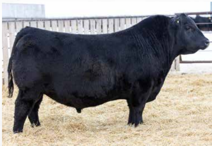
Brooking Mercury 9057 - Maternal Brother