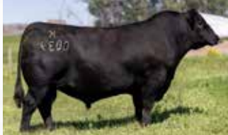
KOUPALS B&B BLACOUT - SIRE

One of two sons of the $40,000 Koupals Blackout 0039 who is a sound moving, easy fleshing, docile natured and bigger framed bull. His dam is a multigenerational Pathfinder and is admired by many as the best female in the Koupal program. Brooking Blackout 3160 is sure to catch your eye come sale day. He is attractive and soggy made with added bone. His stout hip and good hair adds to his attractive build.