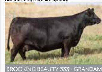
BROOKING BEAUTY 333 - GRANDAM

Introducing another exceptional son of the highly regarded Brooking Emerald 9179, who sold for an impressive $94,500. Brooking Emerald 9179 has truly revolutionized our breeding program with his unmatched ability to produce structurally sound offspring, featuring enhanced rib shape, stylish appearance, and excellent feet. And in the case of Brooking Emerald 3094, you not only get the remarkable genetics from the sire but also the added cow power from the Beauty's lineage on the bottom side. The dam, Brooking Beauty 0181, is an angular and well-constructed female with a nice udder, good feet, and a long, elegant build. Furthermore, the grandam of Brooking Emerald 3094 holds the esteemed title of matriarch at Brooking, having earned well over 1 million dollars with 123 progeny to date. This lineage of success speaks volumes about the quality and potential of this outstanding herdsire option.