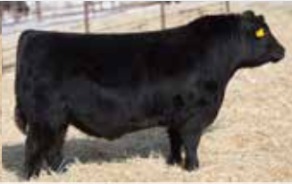
RIVERFRONT ANGUS RANCH