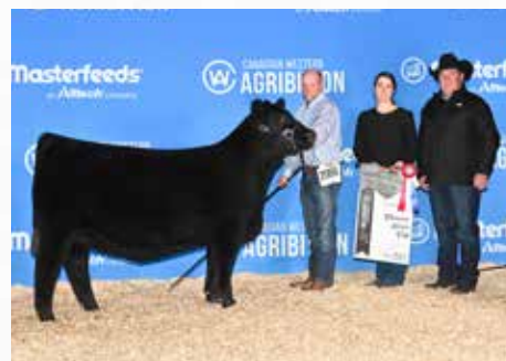
2023 Senior Heifer Calf Champion