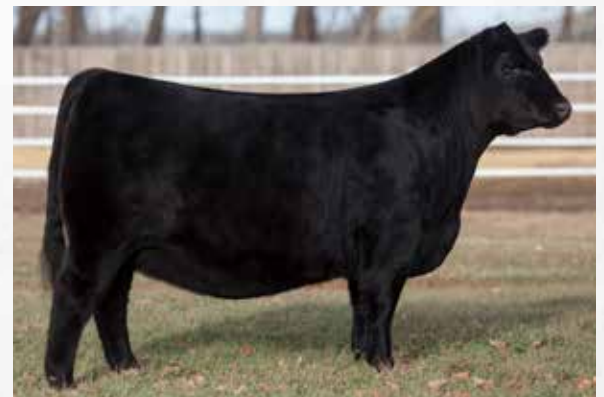
Brooking Dusty's Countess 9026 Maternal Sister to Dam of Lot 14 & 15