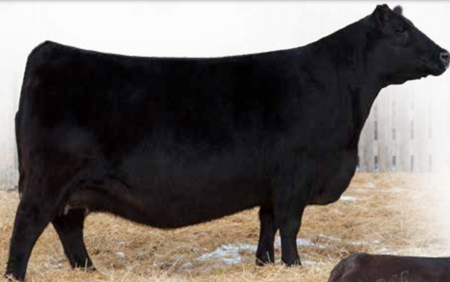
Brooking Beauty 8187 - Dam