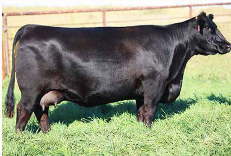
TLA Beauty 6R - Granddam

Leading off the Freedom sons with a powerhouse. Brooking Freedom 3016 owns a massive amount of dimension, thickness, and masculinity. He is docile natured, smooth made with balanced proportions. He has been a standout his entire life. He excelled in performance from a modest 82lb with the highest gain on test from weaning to yearling. His dam, Brooking Beauty 8059 is a low birth weight female with a long body and pretty udder. The granddam is the great TLA Beauty 6R whose daughters and granddaughters are some of the most influential females in the breed. Consistently having awesome udders, great type and the traditional Beauty head.