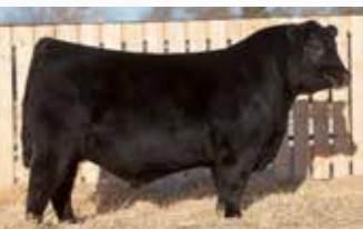
BAR-E-L AND MTC CATTLE