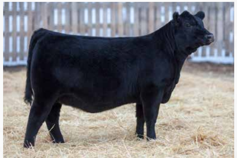
Brooking Rosilla 0147 - Maternal Sister

A favorite herdsire prospect of the entire offering, this impressive individual embodies a combination of quality and balance. One cannot help but admire his strong head, character, masculinity, his muscular hip and smooth movement. His dam, Brooking Rosilla 6038, exemplifies the ideal cow for us. With her moderate frame, excellent udder, great feet, gentle temperament, and overall look, she sets a high standard. Moreover, her remarkable productivity has earned her premier status with the CAA, further reinforcing her quality. Maternal sisters have sold to Bar-E-L Angus, Golden Oak, Compass and Bohrson's as well as two daughters retained in the herd.