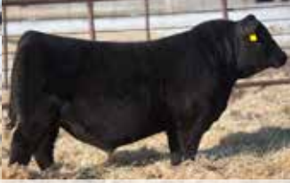
RED WILLOW RANCH