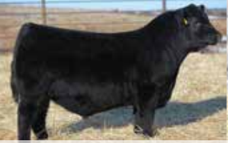
RUST MOUNTAIN VIEW & CANADIAN SIRES