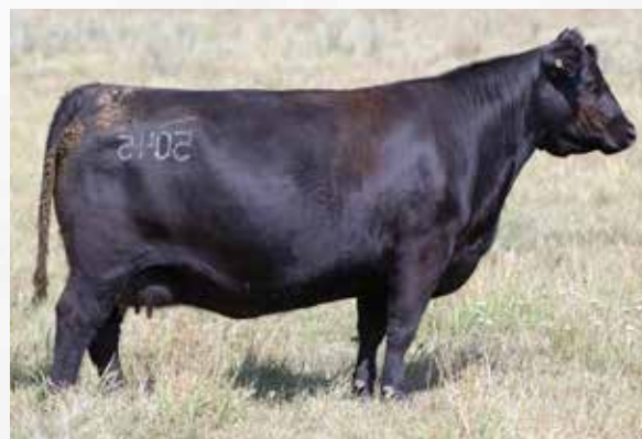
Belvin Georgina 45'15 - Granddam