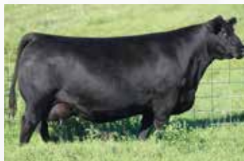
EA Rose 918 Granddam