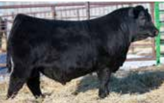
RED WILLOW RANCH