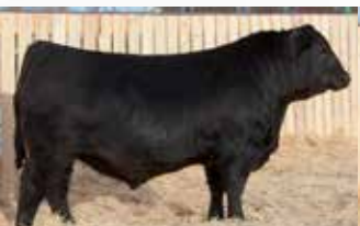
LOST RIVER FARMING