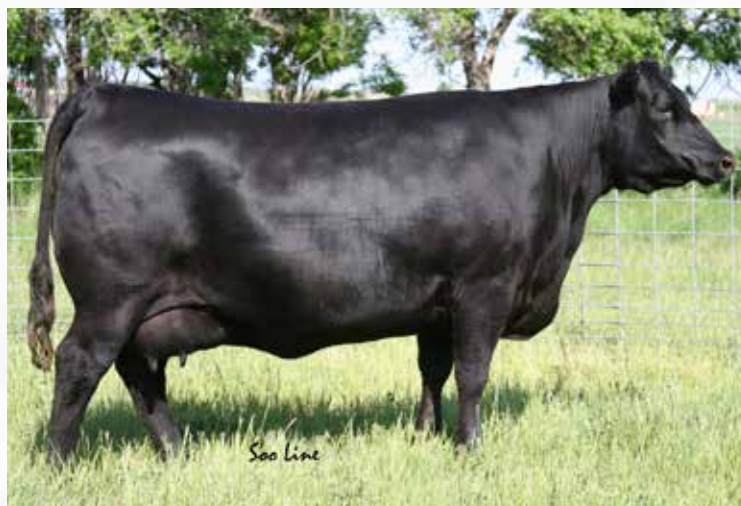
BAX Maureen Emilie 243-559 - Maternal Granddam

Recommended for heifers. All of these Freedom sons are powerful and look like mature herd bulls. Stout-long-masculine. Fertility and longevity are hugely responsible for profitability in the cow calf business. The Maureen Emilie cow family have the credentials required to be the template for a long lasting Angus female. They are good footed, easy fleshing, moderate framed, sound uddered and fertile. The dam Soo Line Maureen Emilie 0144 is still going strong at 14 years of age and was one of the first cows to calve again this year. The granddam was in production at Brooking until she was 16 years of age.